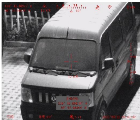
See-through the car window ( laser off)