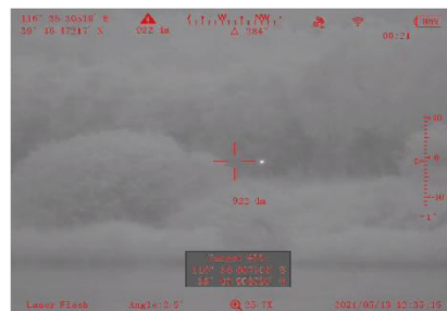
The riflescope is hidden in the woods. The white spot is detected riflescope.