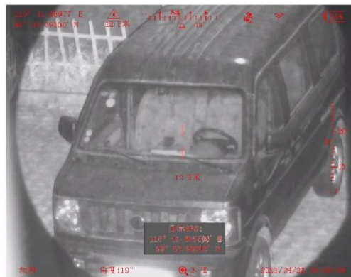
See-through the car window ( laser on)

4. Sniper detection : Use the principle that the laser will be reflected back by the lens of the riflescope, the sniper can be detected and alarmed. The white spot in the window is the detected riflescope.